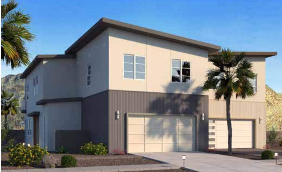
Elevation and renderings are artist concepts

Paired two story home, 3 bedrooms, imagination room, 2 ½ baths, great room, dining room, two car garage.